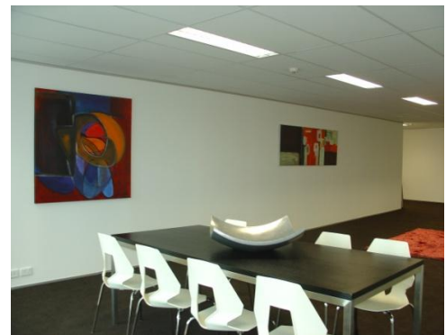
86 Parnell Rd