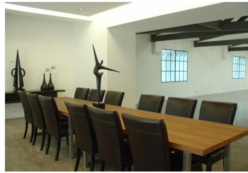
7 Windsor St